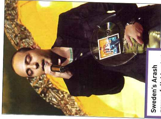
Sweden's Arash gave a full-blooded performance

Organised by the European Commission and in collaboration with its partners, the EBBA project was also joined by MTV Networks.