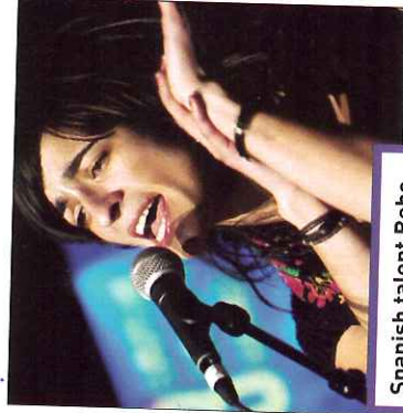
Spanish talent Bebe

Artists, bands, composers, record company representatives and the world's media attended the Palais event which featured live performances by six of the acts, namely Juli, Hush, Amel Bent, Bebe, Arash and Heaven Street Seven. EBBA promotes the richness and diversity of European music by recognising musicians who have been the most successful outside their own countries, based on sales figures provided by Billboard.